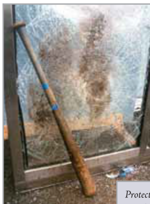
Protected by Madico SafetyShield 1500 UL Certified Anti-Intrusion System.

Flash Ignition Temp. . . . . 760° F Self-Ignition Temp. . . . . 880° F