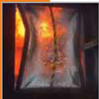
Top: Annealed Glass Filmed with Safety- Shield 1500.